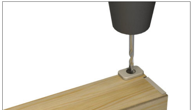
Figure 4 Bottom sash shown.