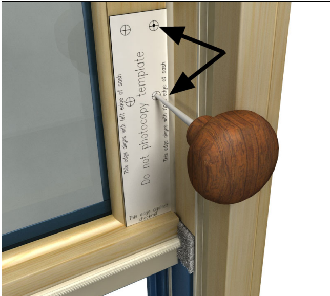
Figure 1 See template (UDH shown) on the bottom of page 3.

You must pre-drill holes prior to installation.