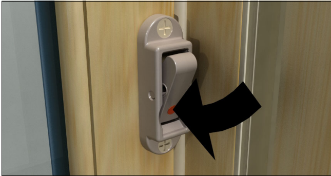
Figure 6 Press the red dot “in” to bypass the control device and fully open the window.

NOTE: When following the template correctly, the window will have an opening height of 4" (102) with the standard sill liner. In order to regain full operation of the window, press the flipper until it rests in the bypass position. Operate the sash like normal. See figures 6 and 7.