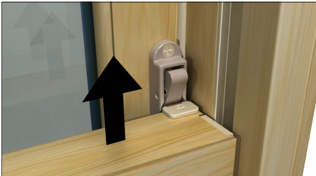
Figure 7 The control device will automatically reset itself once the window sash has been opened past the control device and closed again.