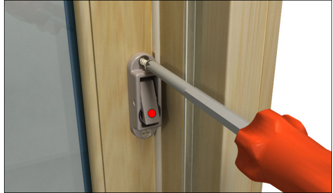
Figure 3 Orient the flipper on the control device as shown.

NOTE: The word "UP" is etched into the back side of the Control Device and should be installed facing toward the stile.