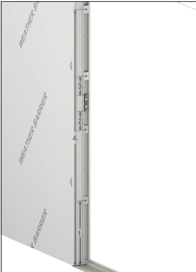
Figure 3 Block Placement for Operator Jambs.

NOTE: 3-Panel OXO configurations only require blocks in the head jamb. Proceed to Step 4.