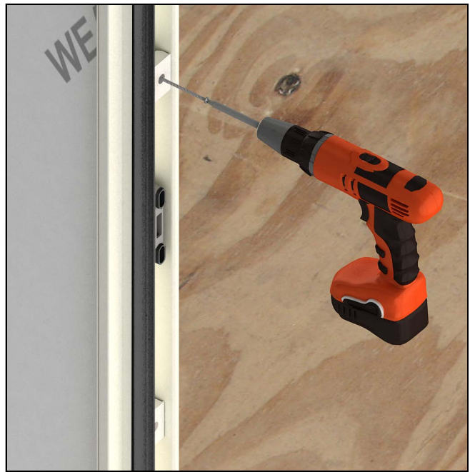
Figure 4 Secure blocks through jambs with 3" screws.

4. Secure all the jamb blocks with the supplied installation screws, using the 3" screws in the operator jamb and the 5/8" screws in the head jamb. See Figure 4 and Figure 5.