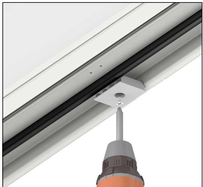
Figure 5 Secure blocks through head jambs with 5/8" screws.