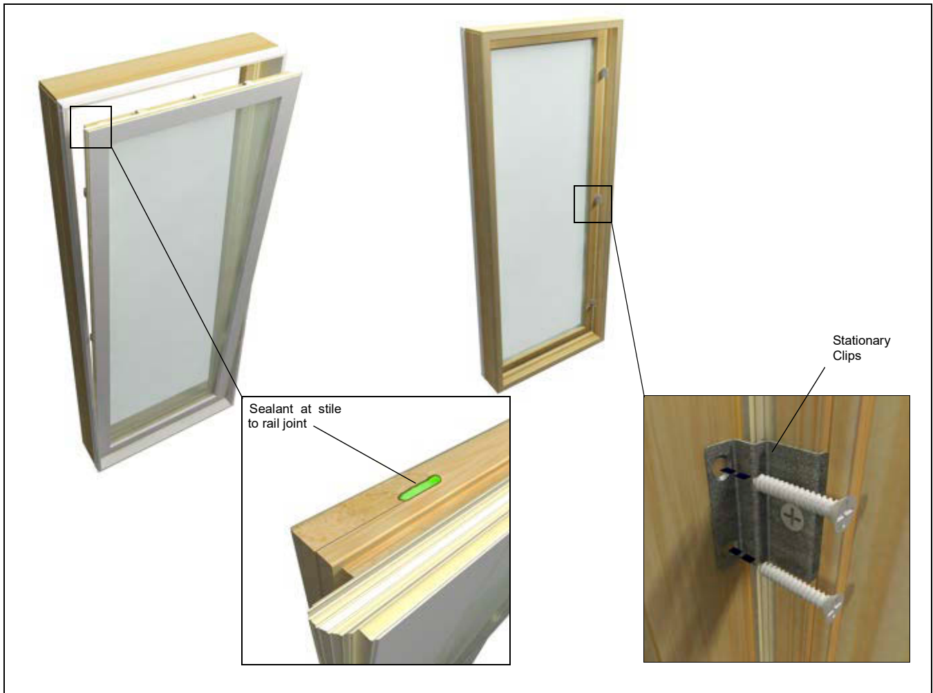
Figure 3 Installing stationary sash and fastening in frame.